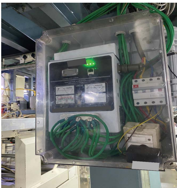
Fig 3: Digital Grounding Device installed in an industry.

The Device and the Claim: The Digital Grounding device consists of a plastic box, with 3 phase input through a 2.5 sq.mm. long wire, a busbar mounted outside the box which can accommodate about 10 connections of M8 Bolt and a surge counter (as fig 3). The claim is, these devices doesn't require connection to an earth electrode. In addition, it is claimed that this device will eliminate the potential between Neutral and PE conductors in the installation. It protects the connected electronic device against harms from Neutral to earth voltage, problems due to earthing and from transient and lightning surges. At the outset it looks like a fantastic solution for solving multiple problems faced